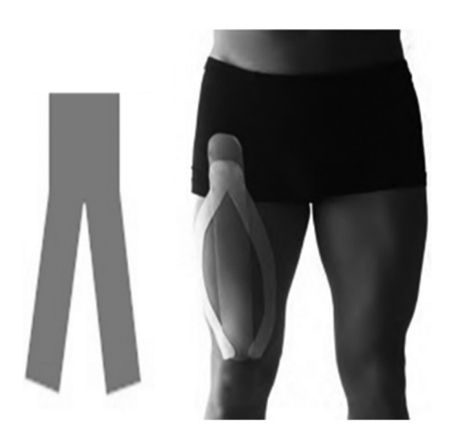
Figure 1. Demonstrative of applying kinesio taping with "Y" shape tape.

The bandage was beige, with a width of 5 x 5 cm, and applied from the source to the inclusion in the stretched