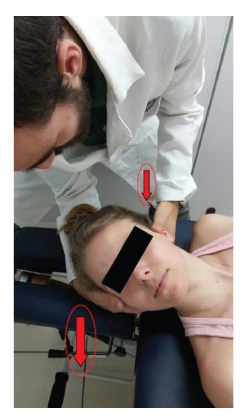
Figure 2. Sham Manipulative Procedure for the Cervical Spine. Small arrow: Chiropractor's hand on the paraspinal area in the restricted vertebra. Big arrow: Chiropractor's forearm as a support for patient head and giving a thrust against the drop headpiece.